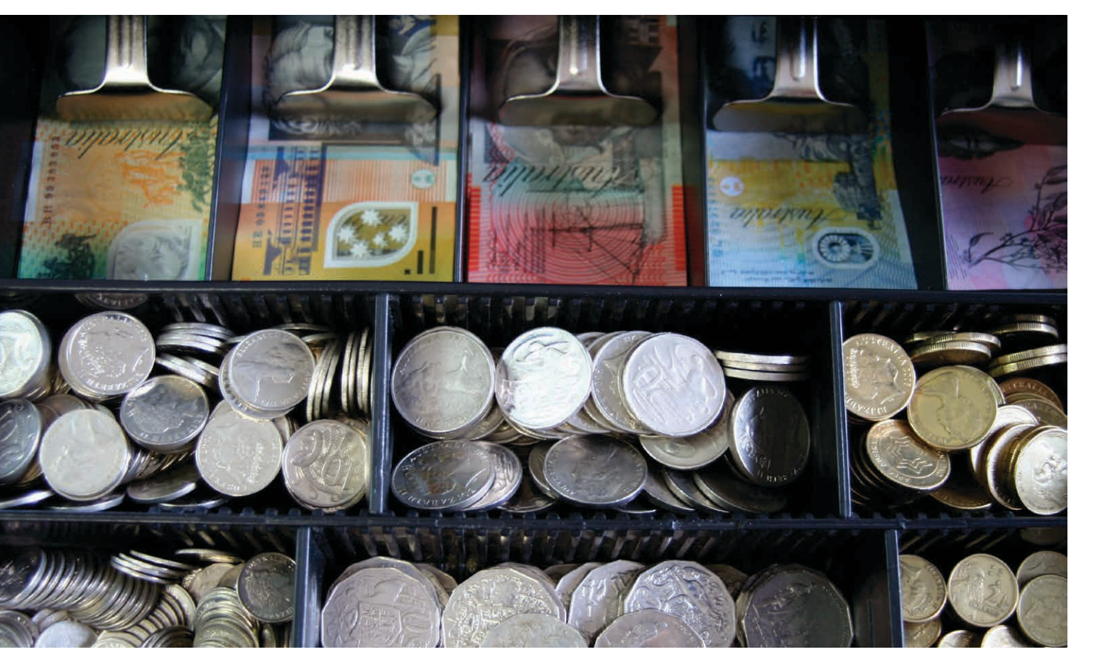
This material is for guidance and general information purposes only. It is not intended to give specific legal or risk management advice nor are any suggestions, checklists or action plans intended to include or address all possible risk management exposures or solutions. You should seek professional advice tailored to your own circumstances.